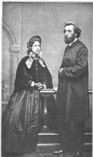
Catherine and William Booth

Later that year, 1865, the couple opened the "Christian Mission" in London's poorer districts. This grew into what we know as the Salvation Army. The Salvation Army went to the poorest areas, provided them food and shelter, and they tirelessly advocated the rights of factory workers, working women and homeless children.