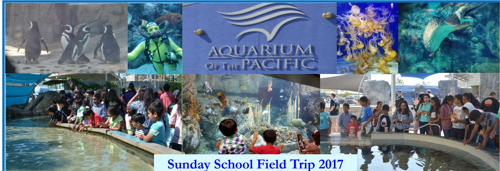
Sunday School Field Trip 2017