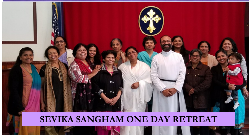
SEVIKA SANGHAM ONE DAY RETREAT

We ask you this, through Christ our Lord. Amen.