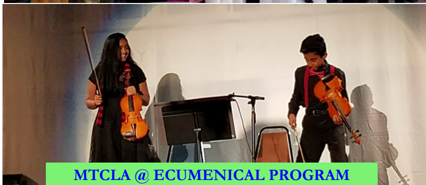
MTCLA @ ECUMENICAL PROGRAM